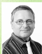
Pierre Tanner (LA Governor) Website, Facebook, Community