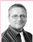
Pierre Tanner (LA Governor) Website, Facebook, Community