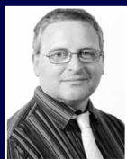
Pierre Tanner (LA Governor) Website, Facebook, Community